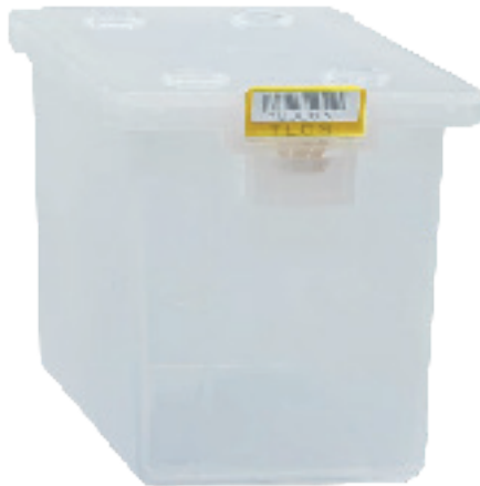
With BioSphere bio-additive