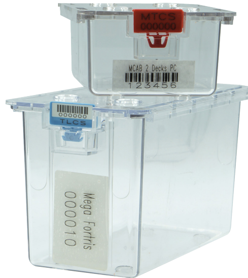
Without BioSphere bio-additive