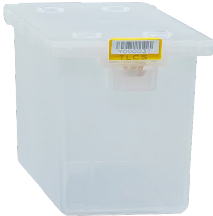
With BioSphere bio-additive